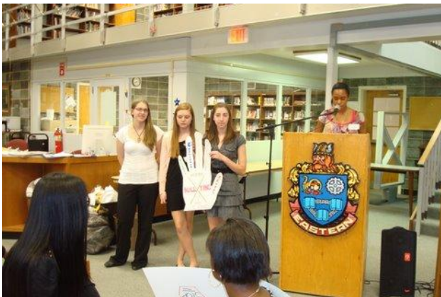
3 -- Vote for me!