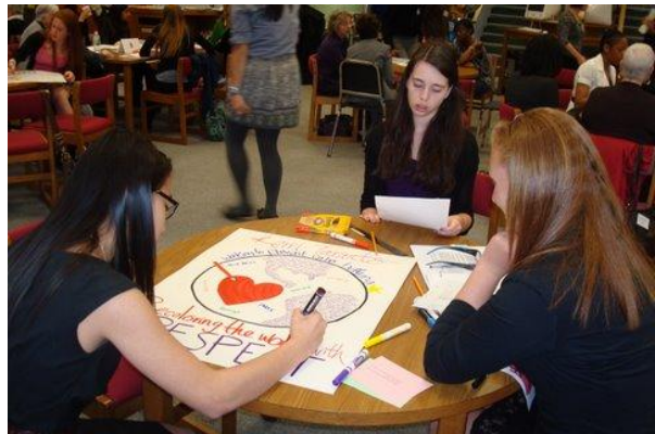
2 - Planning a campaign