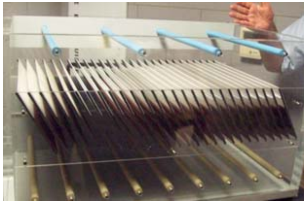
Scale model of a superpulserator