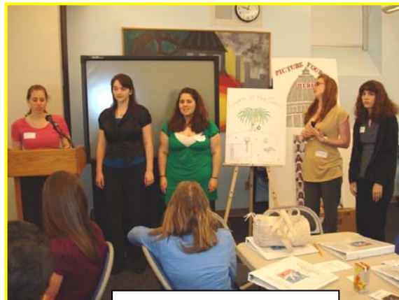
Making the pitch, "Vote for me !"