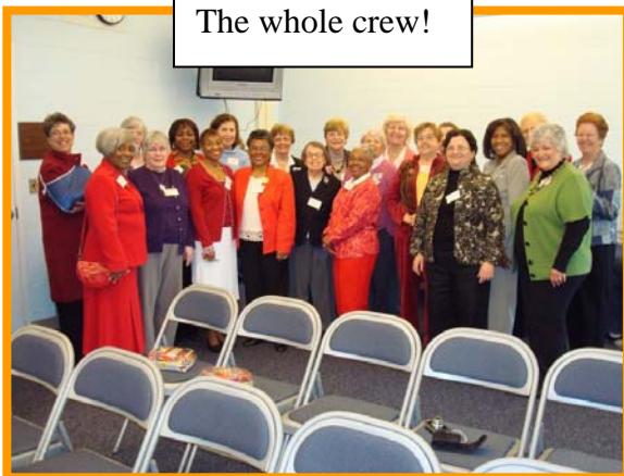
The whole crew!